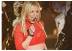
Britney's Circus, her life or her tour or both?