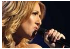
Celine Dion pregnant at 41: Report