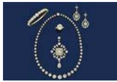
Saying sorry with diamonds?