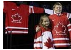
New jerseys mean big cash